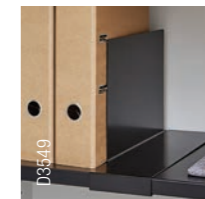
D3549 Book support

Share It offers a wide range of smart internal fittings to optimise the storage capacity and help users file, retrieve information and objects without wasting time.