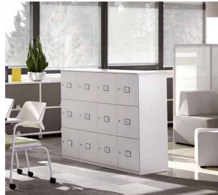
LOCKERS IN SOCIAL ZONE

Share It offers secure lockers for dedicated personal storage or shared use, providing complete peace of mind.