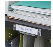
D3547 Magnetic label holder