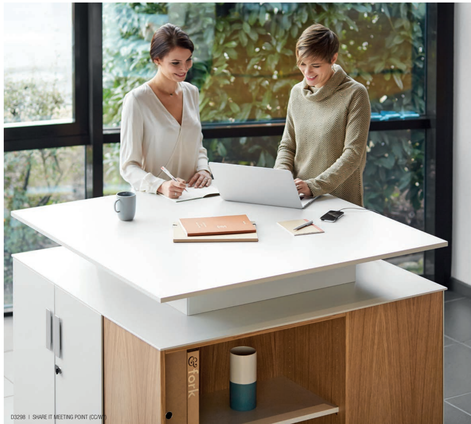
D3298 | SHARE IT MEETING POINT (CC/W)

Glass fronts can be written on to create dynamic and interactive areas for meetings.