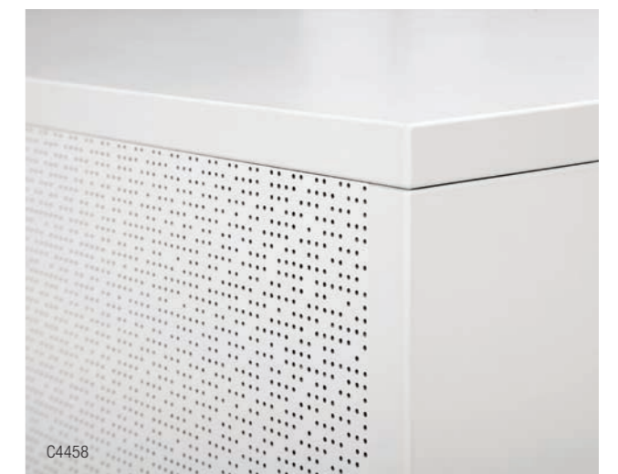
ACOUSTIC MELAMINE BACK OR FRONT