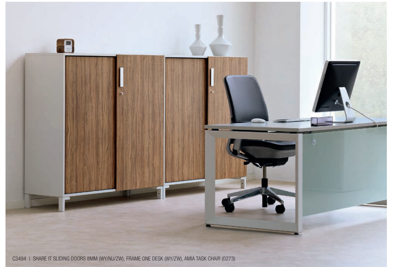
C3494 | SHARE IT SLIDING DOORS 8MM (WY/NU/ZW), FRAME ONE DESK (WY/ZW), AMIA TASK CHAIR (0273)

Share It is elegant everywhere, in any workspace. It provides just the right ambiance for an inspiring, modern office.