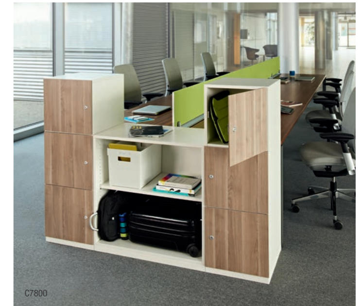
LOCKERS IN NOMADIC ZONE