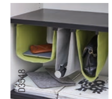
D3548 Suspended fabric folder