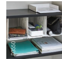
D3650 Folding shelf