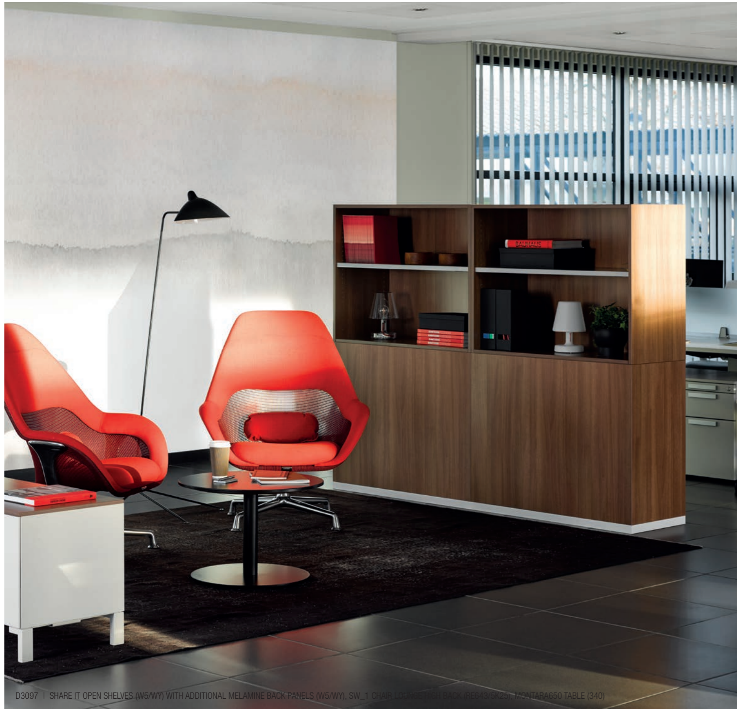
D3097 | SHARE IT OPEN SHELVES (W5/WY) WITH ADDITIONAL MELAMINE BACK PANELS (W5/WY), SW_1 CHAIR LOGO (REF:4316K25), MONTARA650 TABLE (340)