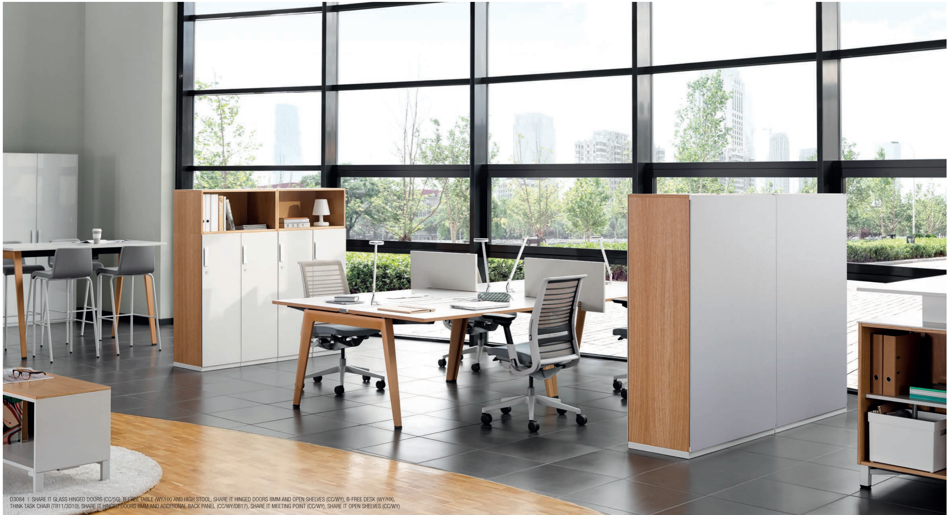
D3084 | SHARE IT GLASS HINGED DOORS (CC/5G), B-FREE TABLE (WY/HX) AND HIGH STOOL, SHARE IT HINGED DOORS 8MM AND OPEN SHELVES (CC/WY), B-FREE DESK (WY/HX), THINK TASK CHAIR (TR11/3D10), SHARE IT HINGED DOORS 8MM AND ADDITIONAL BACK PANEL (CC/WY/DB17), SHARE IT MEETING POINT (CC/WY), SHARE IT OPEN SHELVES (CC/WY)